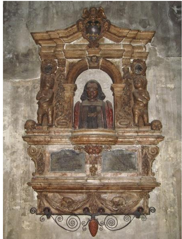
Caption – the Dobson memorial