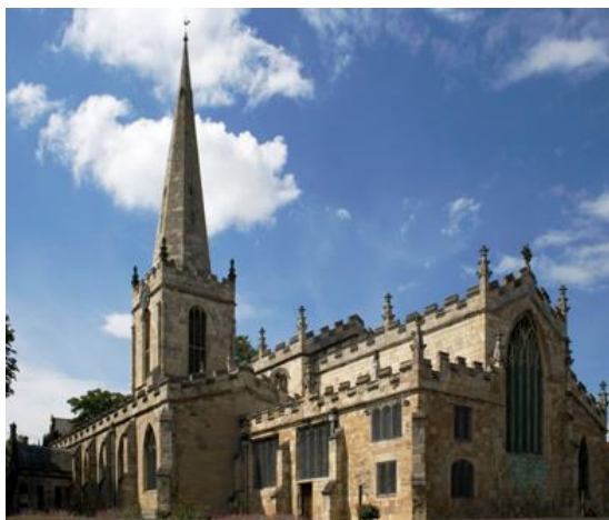
All Saints', Hessle