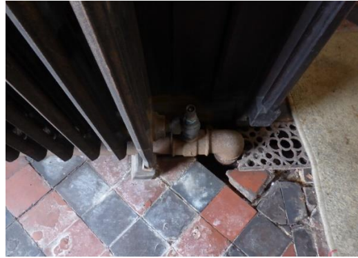
St Mary's heating has not worked for years, the floor, covered by the Victorians in impermeable tiles, has suffered from damp. Work is urgently needed to install new heating, electrics, boilers, kitchen facilities and floor.

In November applications were made to the National Churches Trust 'Cornerstone' grant scheme, to the Wolfson Foundation towards