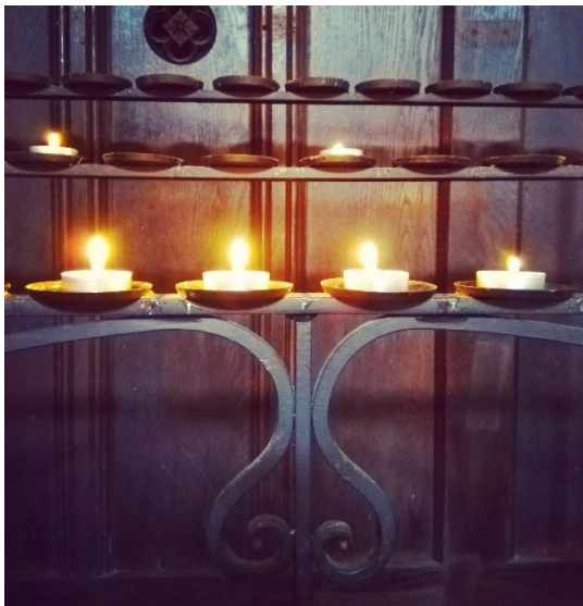
Caption – St Mary's has been open on Saturdays for Private Prayer since July